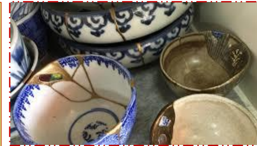
An example of Kintsugi