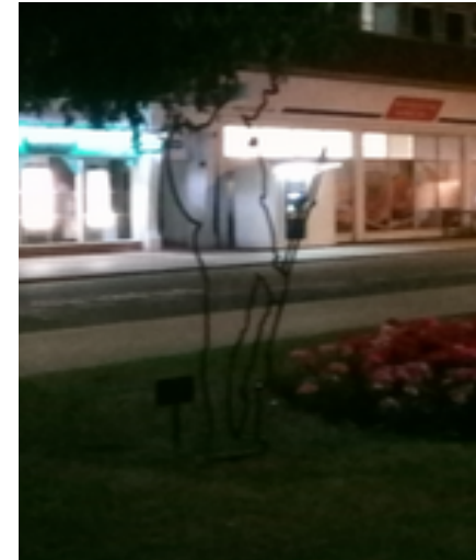
(A Felixstowe “Tommy” – night-time at The Triangle)

May God the Father bless us; may Christ take care of us; the Holy Ghost enlighten us all the days of our life.